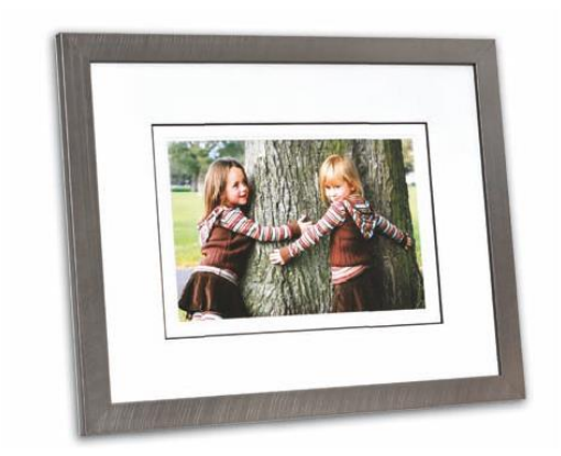
Petit Argento Pewter 14x11" - Code 2FF